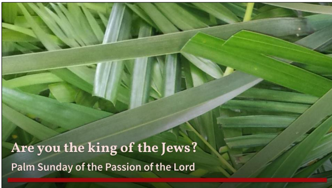
Are you the king of the Jews? Palm Sunday of the Passion of the Lord